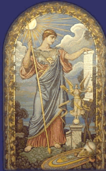
Mosaic of Minerva, Great Hall of the Library of Congress